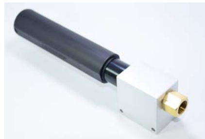
Vacuum pump high vacuum level