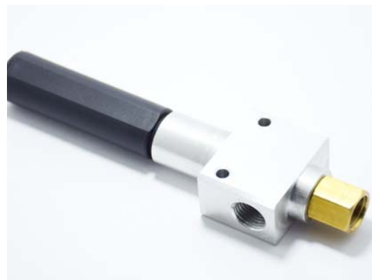
Vacuum pump high vacuum level